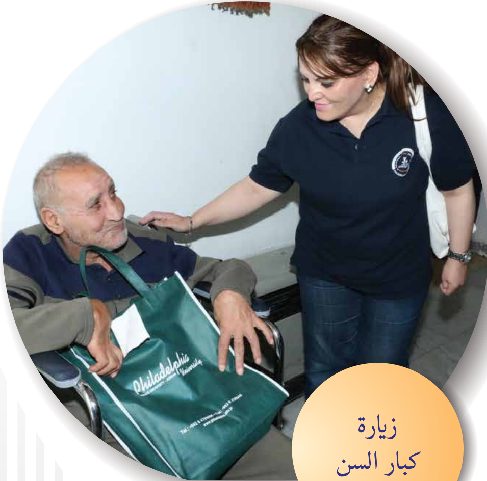
زيارة كبار السن