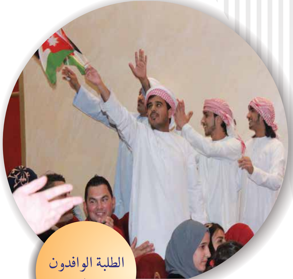
الطلبة الوافدون يحتفلون