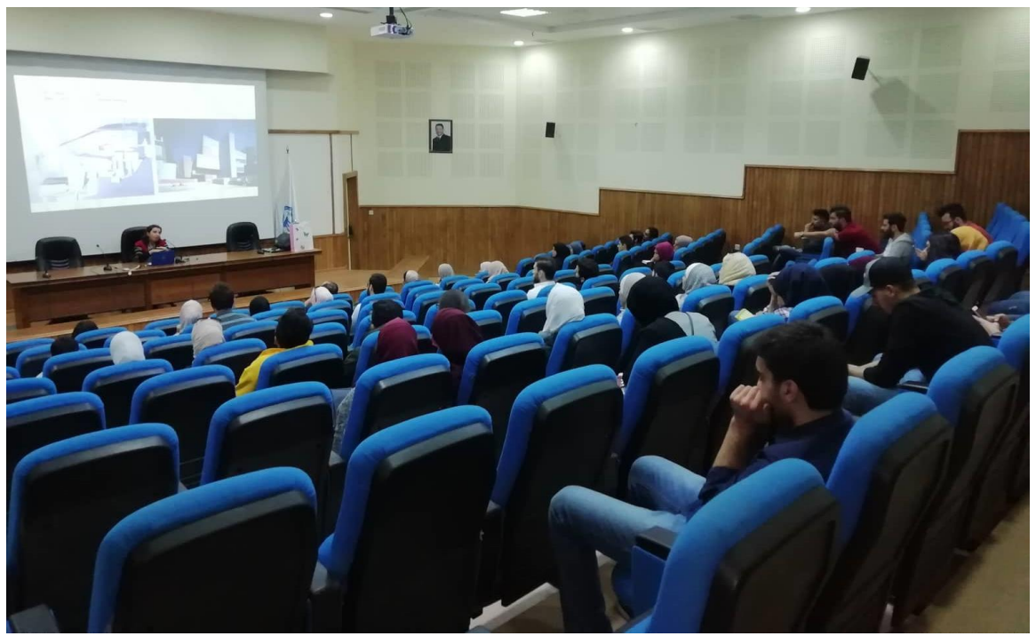
6/10 | Page